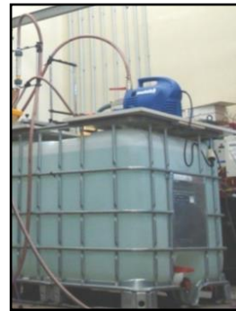
Extern circle for the cooling system of copper shoes