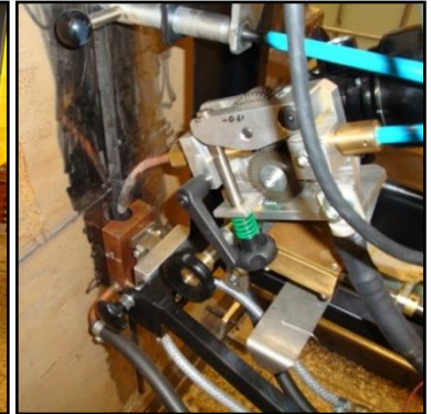
Wire feed system