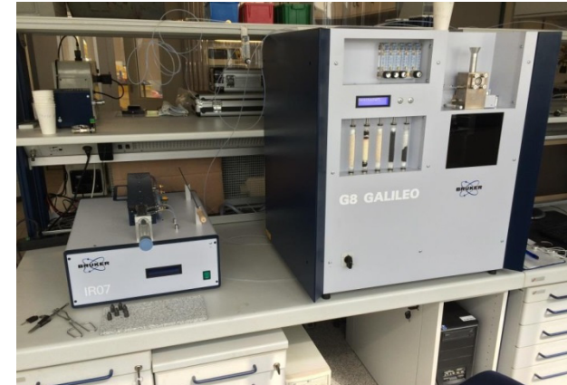
Analysis system consisting of infrared furnace and melting furnace to determine the hydrogen/oxygen/nitrogen content in steel, copper, aluminium and titanium