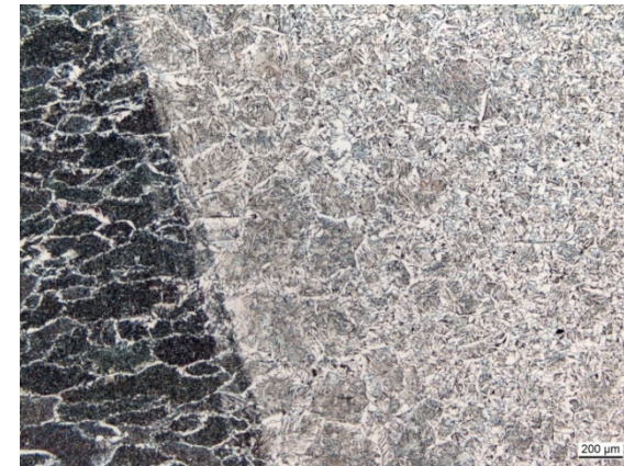
Microstructure of a weld seam "Weld material meltline coarse grain zone"