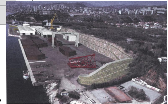
Steel Structure Production Facility